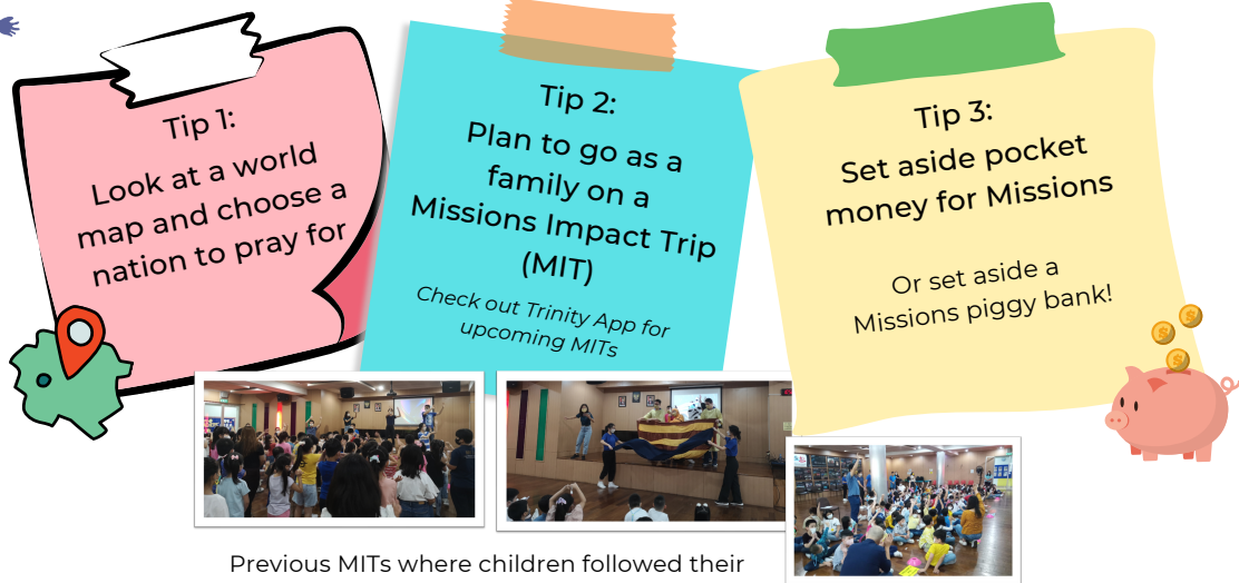
Previous MITs where children followed their parents to serve the nations

Let's continue to disciple a generation that loves God and loves people. Pray with us that our children will hear God's call for their lives and learn to live by faith!